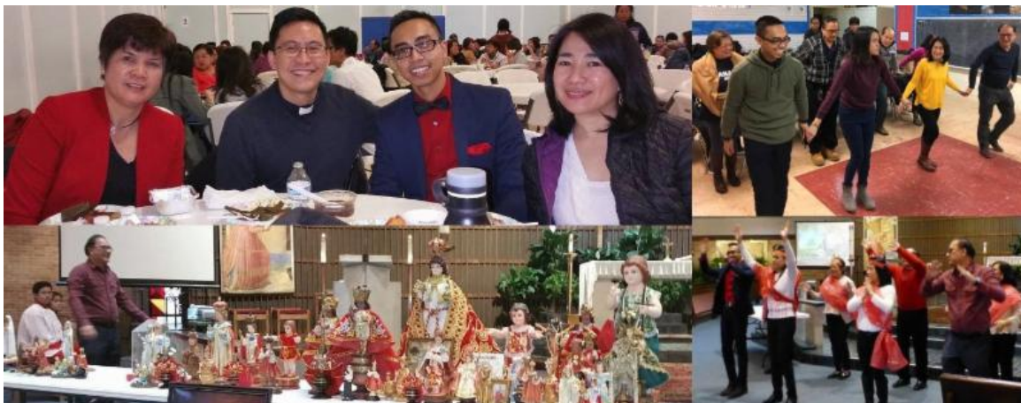
PUBLIC ART SITE VISIT (D.C. ARTIST EMZKI) ON BEHALF OF DC COMMISSION ON ARTS & HUMANITIES