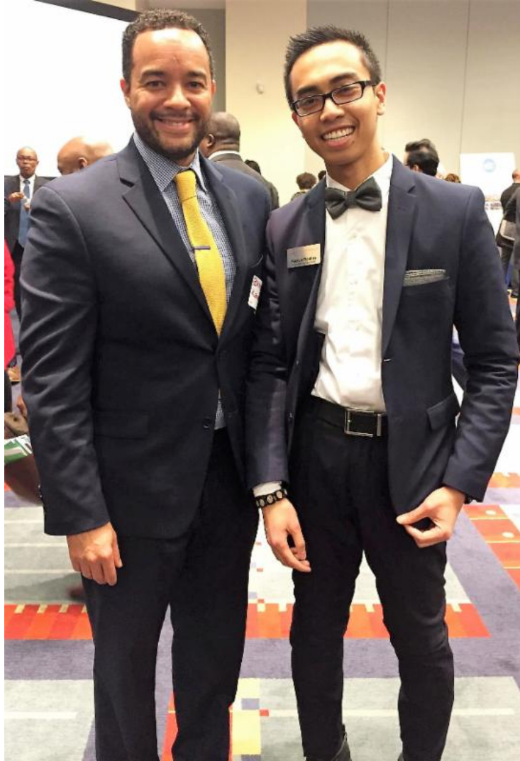
FEAST OF SANTO NIÑO WITH ST. JUDE FILIPINO COMMUNITY ROCKVILLE, MARYLAND