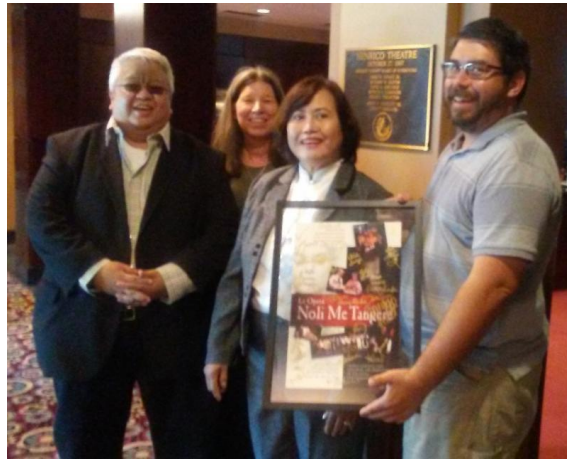
Immortalizing Le Opera Noli Me Tangere at Historic Henrico Theatre