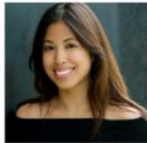
Le Opera Noli Me Tangere