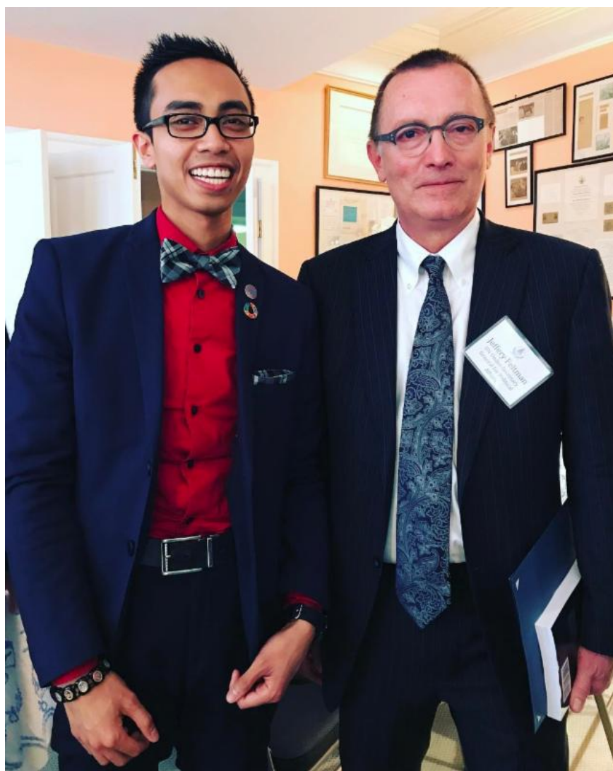
LECTOR AT ST. CHARLES BORROMEIO CATHOLIC CHURCH ARLINGTON, VIRGINIA USA