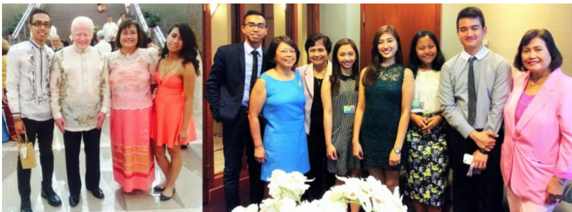
(Left to Right): Patis Tesoro Fashion Show at Ronald Reagan Building (June 11)