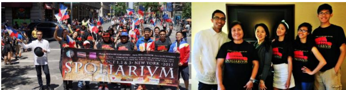
(Left to Right): Philippine Independence Day Parade in New York (June 7) Planning Meeting with American University Students Post-Parade (June 7)