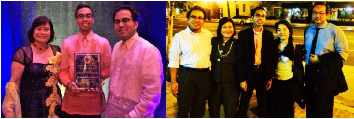
(Left to Right): Migrant Heritage Commission People's Ball (June 27) Informal Jazz Outting with Japanese Minister Mr. Masato Otaka (June 29)