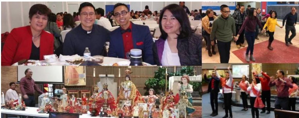
PUBLIC ART SITE VISIT (D.C. ARTIST EMZKI) ON BEHALF OF DC COMMISSION ON ARTS & HUMANITIES