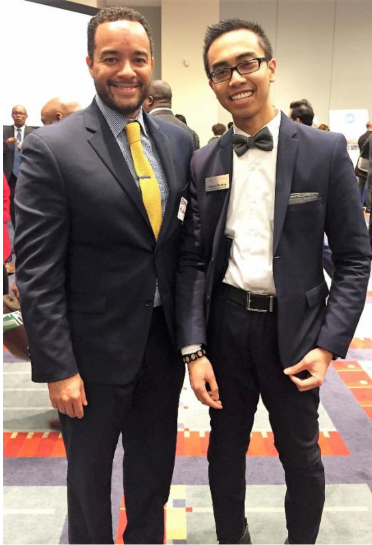
FEAST OF SANTO NIÑO WITH ST. JUDE FILIPINO COMMUNITY ROCKVILLE, MARYLAND