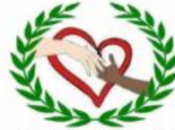
Varcara Orphans Foundation

7500 Livingston Road | Oxon Hill | MD 20745